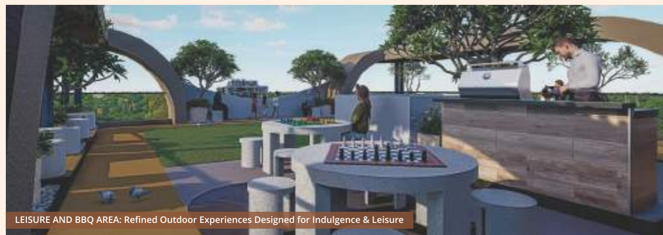
LEISURE AND BBQ AREA: Refined Outdoor Experiences Designed for Indulgence & Leisure

VISION VENETIA Quiet. Refined. Exclusive.