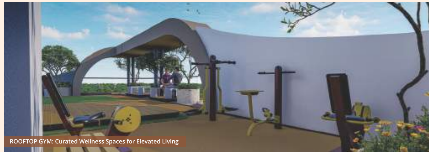
ROOFTOP GYM: Curated Wellness Spaces for Elevated Living