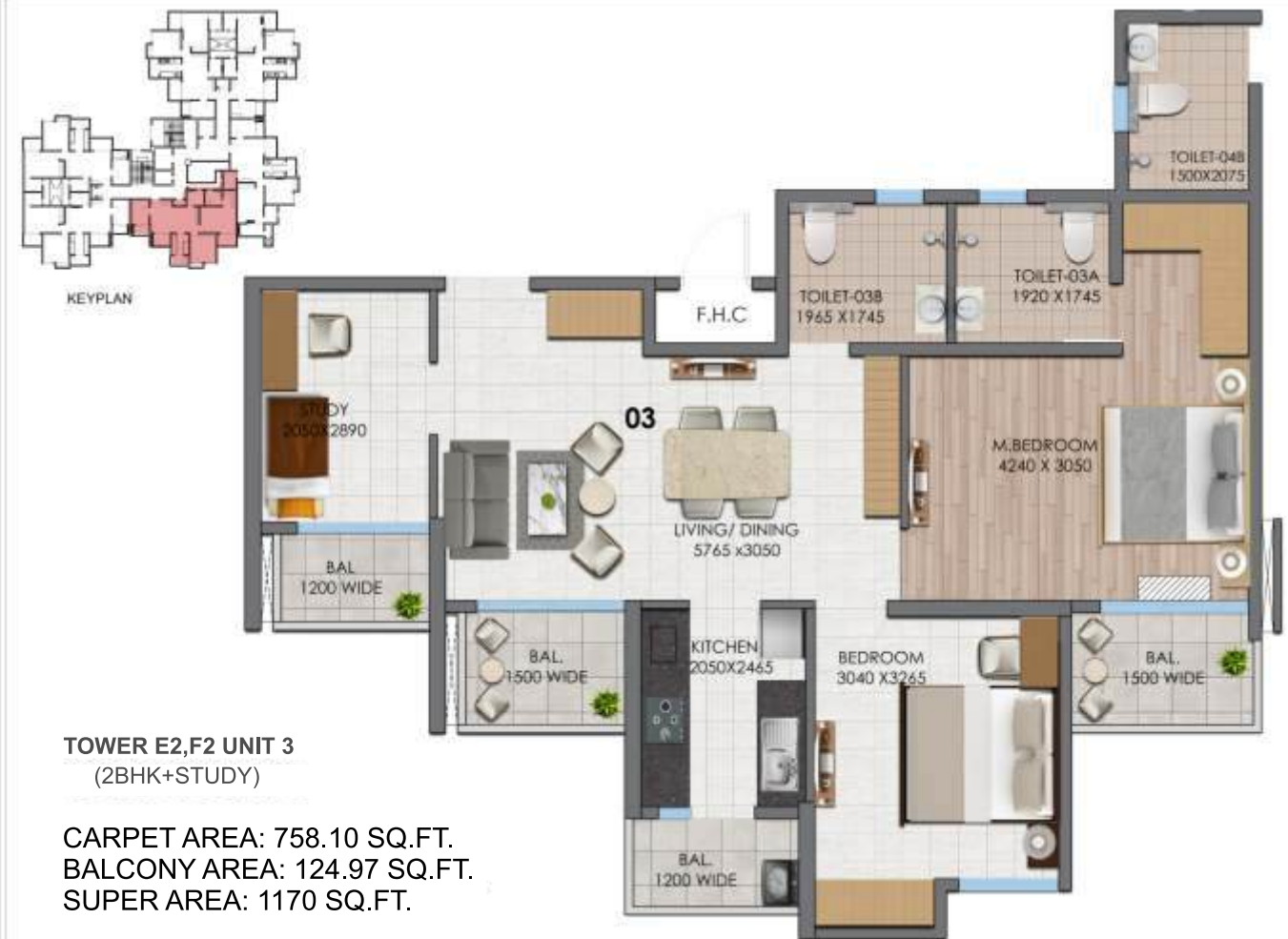
TOWER E2,F2 UNIT 3 (2BHK+STUDY)

CARPET AREA: 689.54 SQ.FT. BALCONY AREA: 131.75 SQ.FT. SUPER AREA: 1125 SQ.FT.