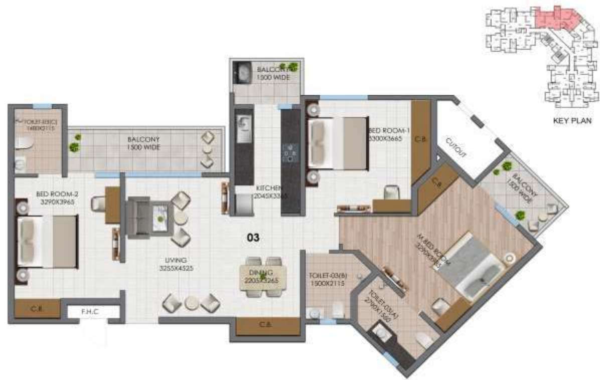
TOWER E3,F3 UNIT 03,04 (3BHK+3T+STORE)

CARPET AREA: 1005.05 SQ.FT. BALCONY AREA: 156.72 SQ.FT. SUPER AREA: 1560 SQ.FT.