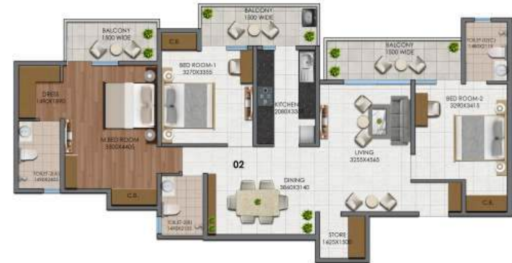
TOWER E3,F3 UNIT 2 (3BHK+3T+STORE)

CARPET AREA: 1058.31 SQ.FT. BALCONY AREA: 207.09 SQ.FT. SUPER AREA: 1735 SQ.FT.