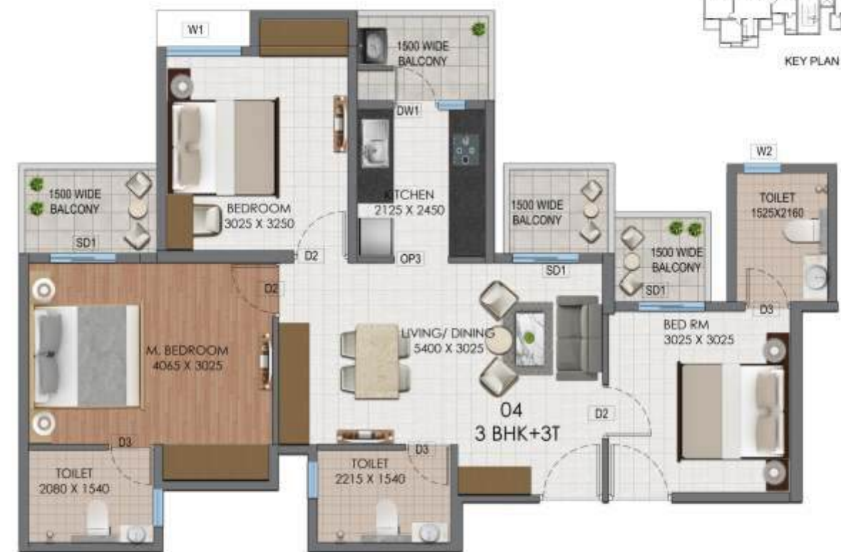
TOWER L UNIT-01,02,04 (3BHK+3T)

CARPET AREA: 849.21 SQ.FT. BALCONY AREA: 129.58 SQ.FT. SUPER RAEA: 1315 SQ.FT.