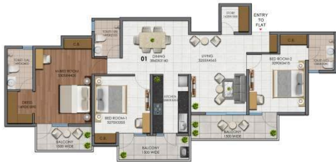
TOWER E3,F3 UNIT 1 (3BHK+3T+STORE)

CARPET AREA: 1058.31 SQ.FT. BALCONY AREA: 207.09 SQ.FT. SUPER AREA: 1735 SQ.FT.