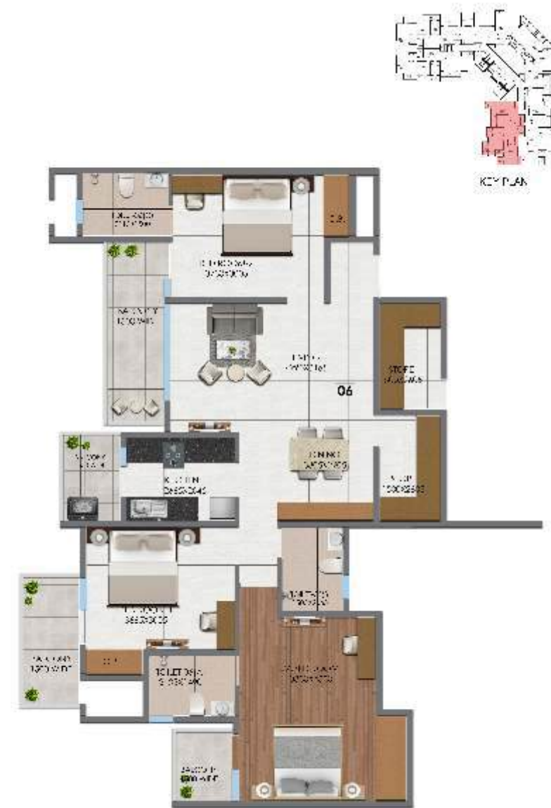
TOWER E3,F3 UNIT 5,6 (3BHK+3T+STORE)

CARPET AREA: 1005.05 SQ.FT. BALCONY AREA: 156.72 SQ.FT. SUPER AREA: 1560 SQ.FT.