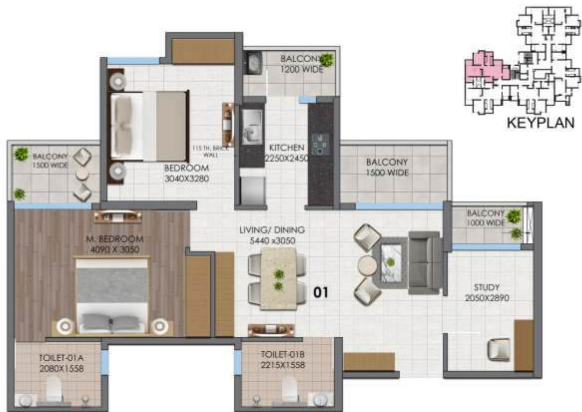
TOWER E2,F2 UNIT 1,2 (2BHK+STUDY)

CARPET AREA: 689.54 SQ.FT. BALCONY AREA: 131.75 SQ.FT. SUPER AREA: 1125 SQ.FT.