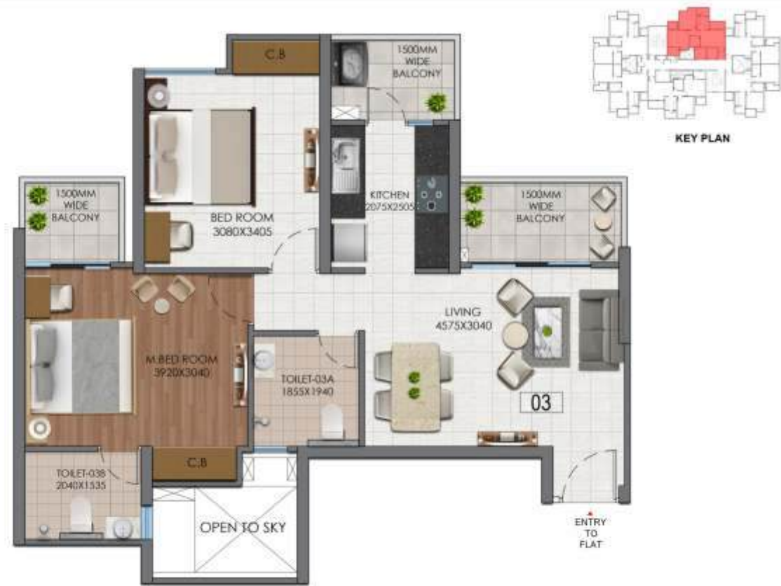
TOWER J1 UNIT- 3 (2BHK+2T)

CARPET AREA: 597.61 SQ.FT. BALCONY AREA: 113.34 SQ.FT. SUPER AREA: 970 SQ.FT.