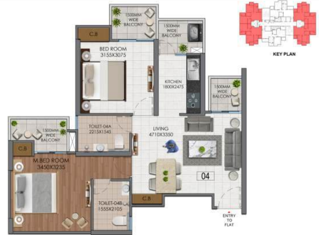
TOWER J1 UNIT- 1,2,4,5 (2BHK+2T)

CARPET AREA: 585.13 SQ.FT. BALCONY AREA: 124.00 SQ.FT. SUPER AREA: 970 SQ.FT.