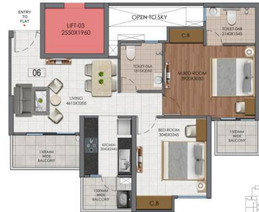
TOWER J1 UNIT- 6 (2BHK+2T)

CARPET AREA: 597.61 SQ.FT. BALCONY AREA: 113.34 SQ.FT. SUPER AREA: 970 SQ.FT.